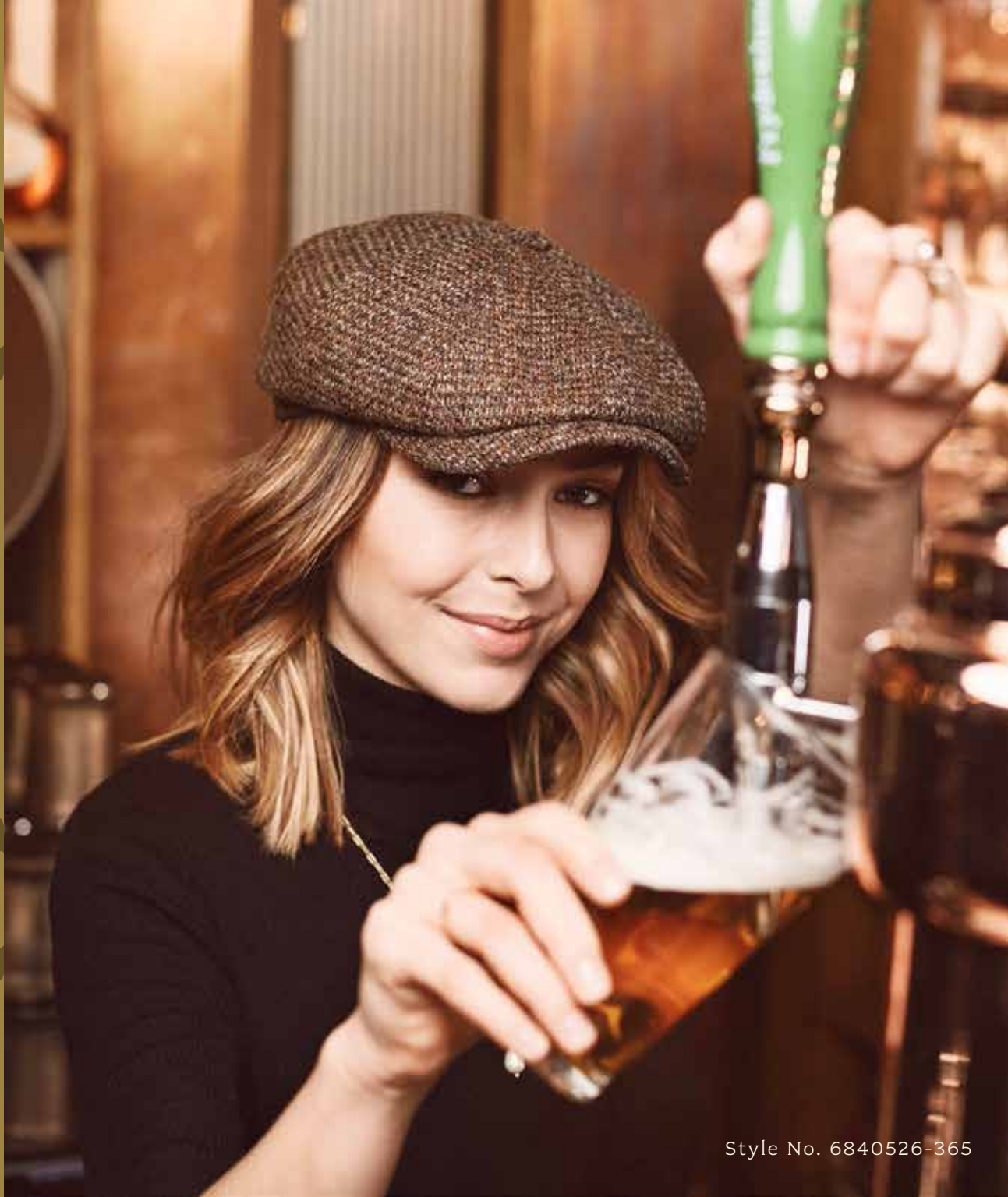
Style No. 6840526-365