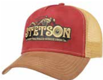
Style No. 7756105-68