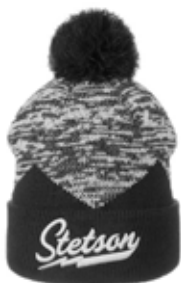
Style No. 8599125-1