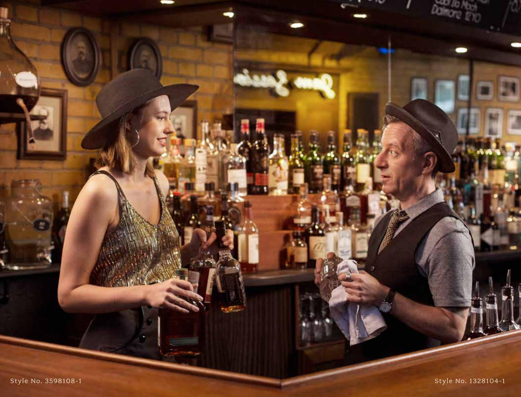
Style No. 3598108-1