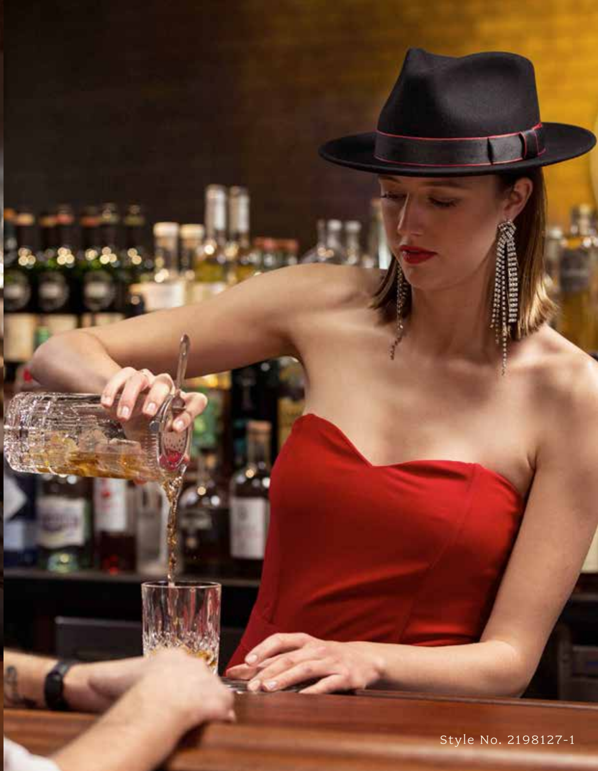
Style No. 2198127-1