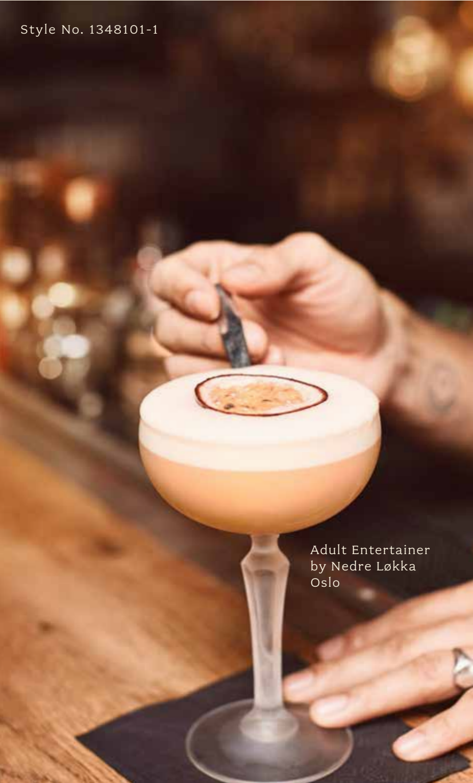
Adult Entertainer by Nedre Løkka Oslo