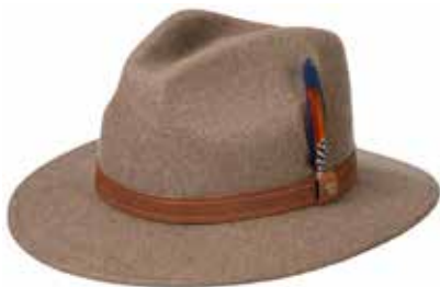
Style No. 2598113-70