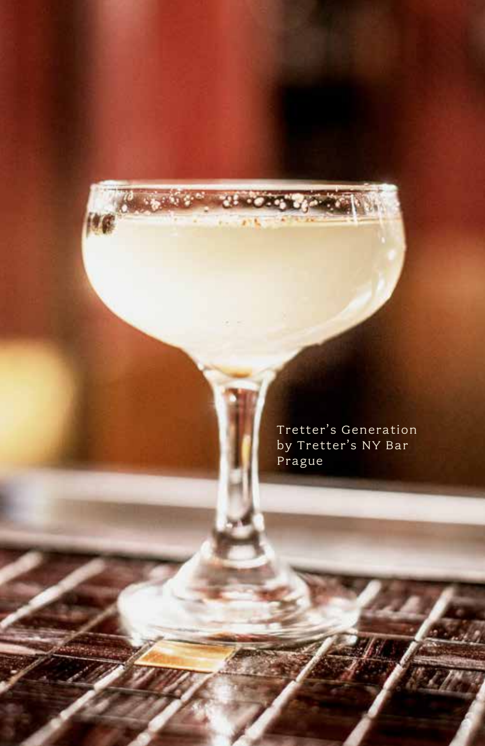
Tretter's Generation by Tretter's NY Bar Prague