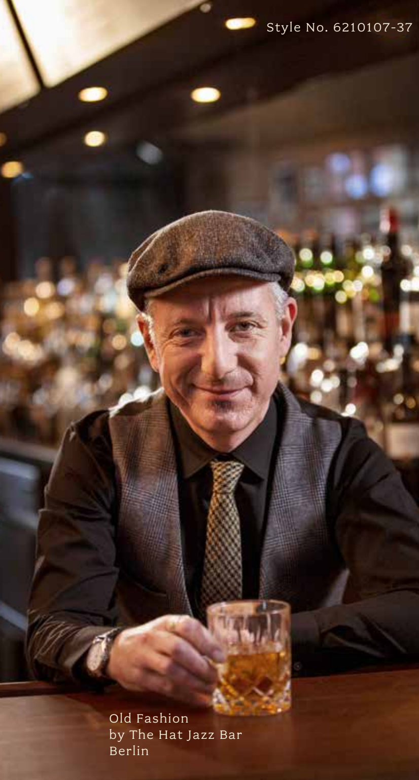
Old Fashion by The Hat Jazz Bar Berlin